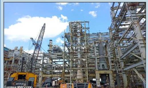
500 TPD METHANOL PROJECT