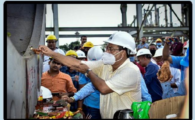
Erection of Methanol Reactor