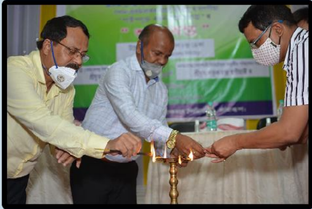
PNG Project Inauguration