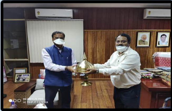
MD'S courtesy visit to Industry Minister's office