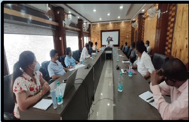
Project Review Meet