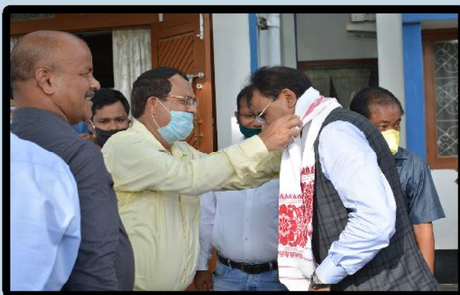
Hon'ble Industry Minister of Assam Visited APL