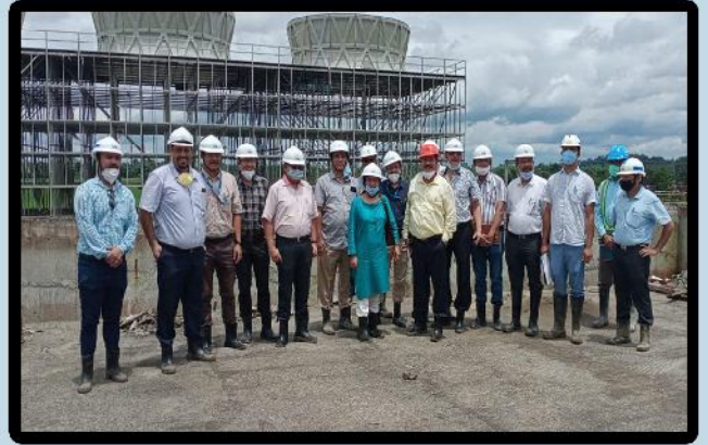
Hon'ble Board of Directors at APL