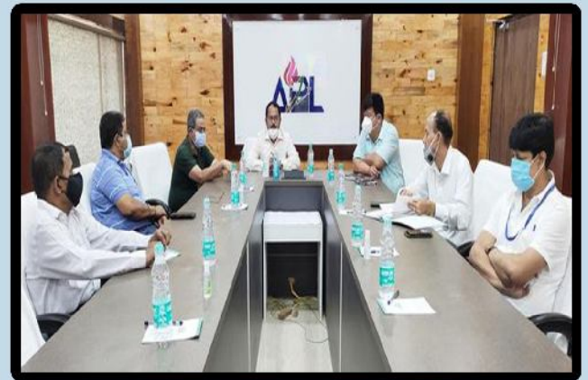
Meeting with AGCL