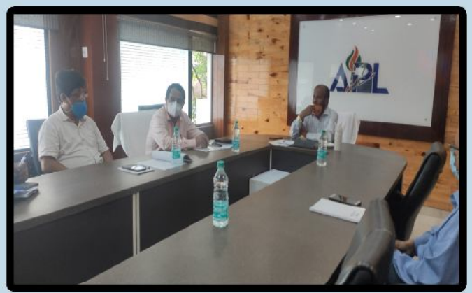
Hon'ble Chairman visit at APL