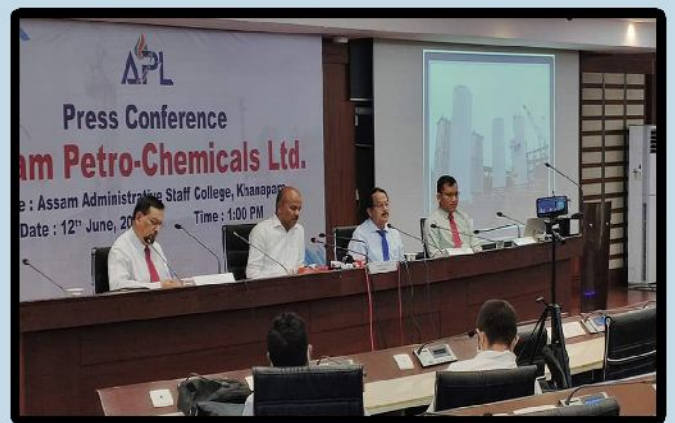
Press Conference at Guwahati