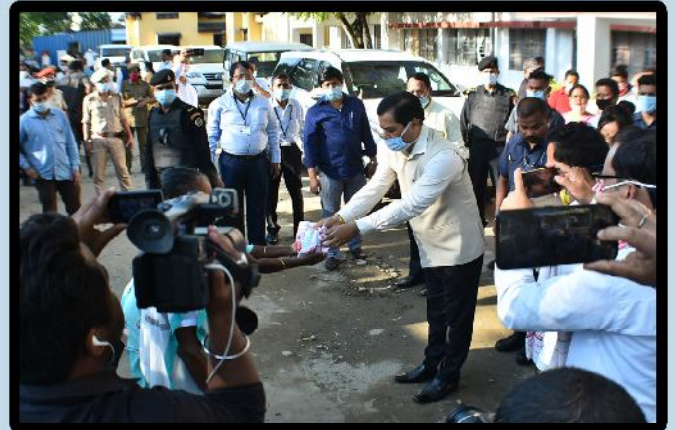
Felicitation to sanitization worker by Hon'ble CM of Assam at APL