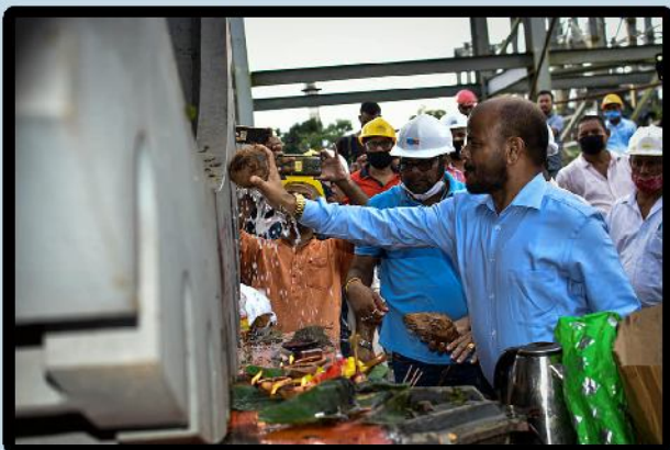
Erection of Methanol Reactor